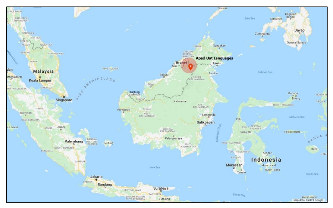
Figure 1: Approximate location of the Apad Uat languages

Kelabit (kzi, 639-3) is a Western Austronesian<sup>1</sup> language of Northern Sarawak, Malaysia (Martin, 1996). It belongs to the Apad Uat subgroup<sup>2</sup> of Malayo-Polynesian which also includes Lun Bawang/Lundayeh and Sa'ban. Apad Uat languages are spoken in Northern Sarawak as well as across the borders into Brunei, Sabah, and Kalimantan, Indonesia (Kroeger, 1998a). This is indicated in red in Figure 1.