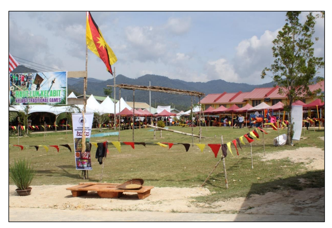
Figure 3: Bario during the Bario Food Festival (Pesta Nukenen) 2014