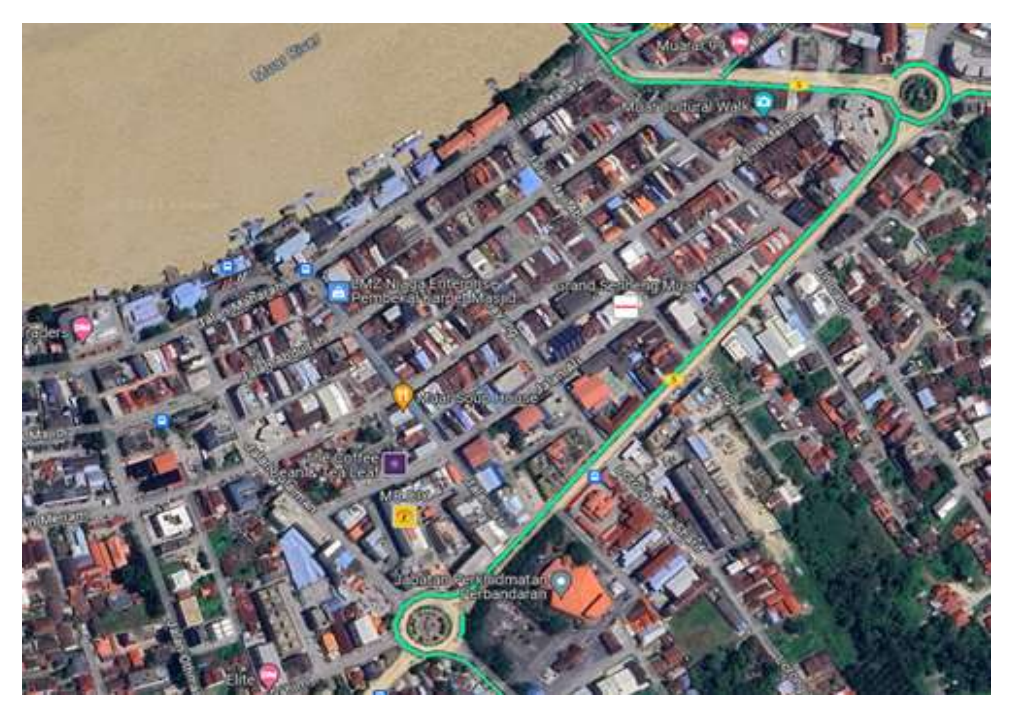
Figure 3. Area of monitoring and surveillance.

They utilized a 5-point rating scale, where a score of 1 indicated the poorest condition and a score of 5 indicated the best condition. This systematic approach allowed for a quantifiable measure of the facade's condition. The final step in the assessment process involved determining the overall condition of each facade by calculating the mean score from the ratings provided by the experts. The mean score was calculated using the following formula [30]: