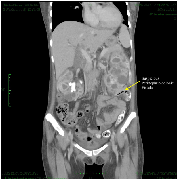
Figure 1: Coronal view CECT abdomen shows a suspicious left perinephric-colonic fistula