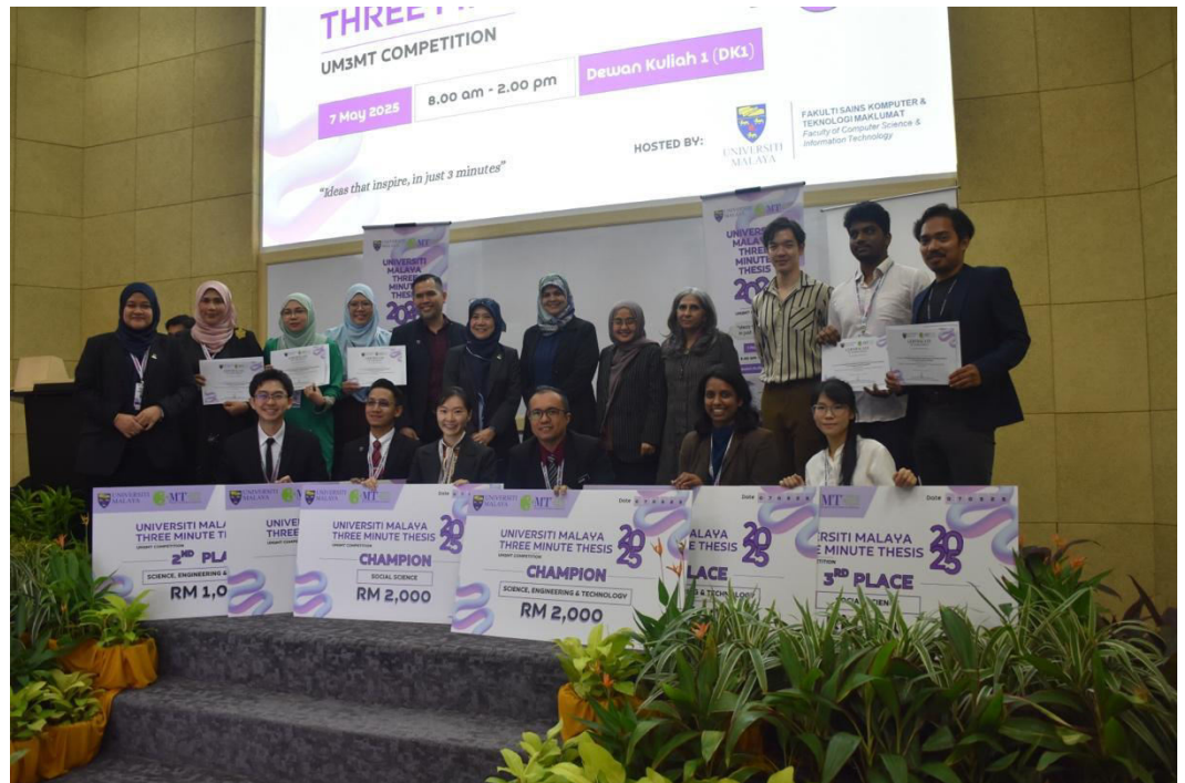
Winners of the UM3MT 2025 University-Level Competition proudly pose with their prizes and certificates alongside the panel of judges and organising committee.

Postgraduate Office, Faculty of Computer Science & Information Technology, UM