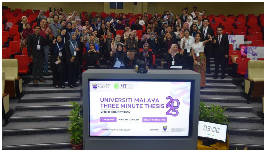
FSKTM team together with all UM3MT 2025 participants at the end of the university level competition